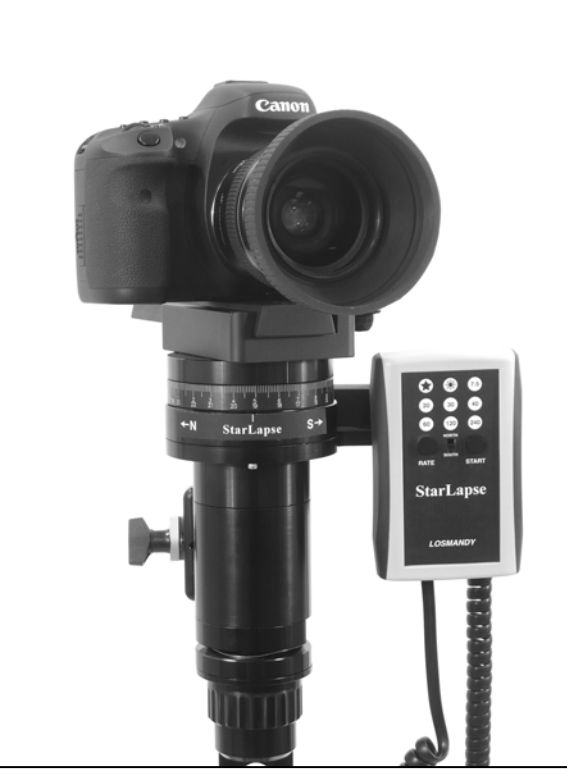
StarLapse for basic time-lapse, with Canon 7D DSLR. (System as shown without camera: $57500)