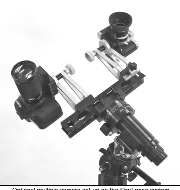
Optional multiple camera set-up on the StarLapse system.

For example videos of the StarLapse in operation go to www.losmandy.com .