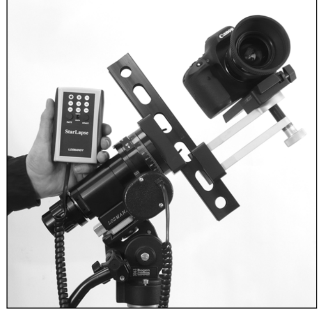
StarLapse system $69500 as shown, less camera and tripod.