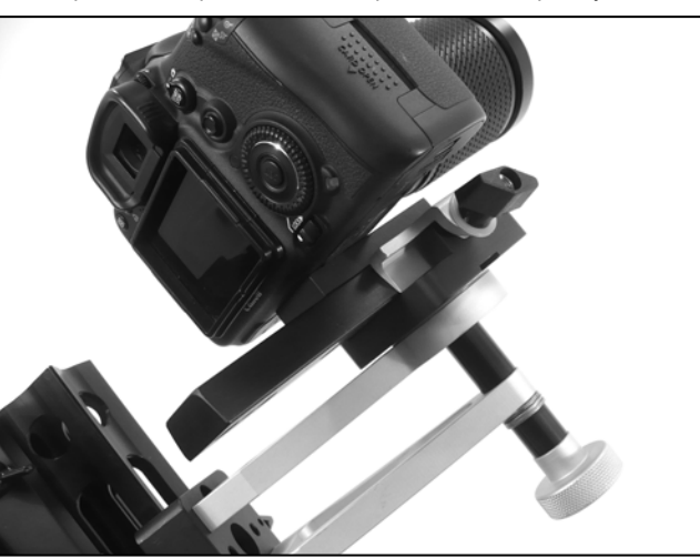
The sliding dovetails permit quick and easy balancing without the need for any counterweights, even when using a long lens.

Dimensions: Main assembly 4" diam. x 8"; Beam 1.625" x 12"; Camera Mount 5" x 8" x 3" Weight: 8.75 lbs. (4 kg.) Gear Drive Assembly and Controller: $575.00 Camera Mount Assembly: $115.00 12" Beam: $35.00 System List Price: $695.00 (Includes above three pieces) Optional Battery Pack (8xAA) $16.00 Optional Polar Scope (PS) $200.00 NOTE: StarLapse is compatible with GM 8 and GEMINI 2 electronics for full astronomical capability.